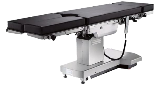
SBG Operation Table