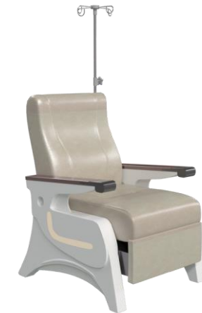
SBG Luxury InFusion Chair