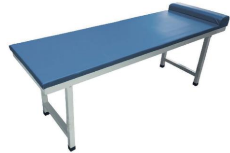
SBG Examination Bed