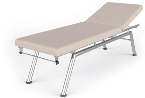
SBG Deluxe Examination Bed