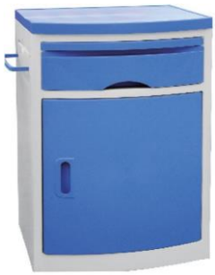
SBG Bedside Cabinet A

SBGSL121A (Multicolor) L480 × W480 × H760mm