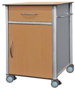
SBG Bedside Cabinet