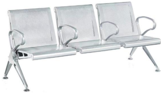
SBG Waiting Chair