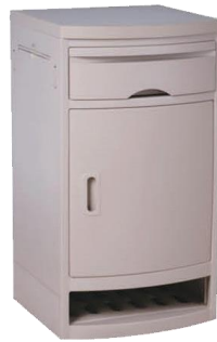
SBG Bedside Cabinet C

SBGSL121B (Multicolor) L450 × W420 × H730mm