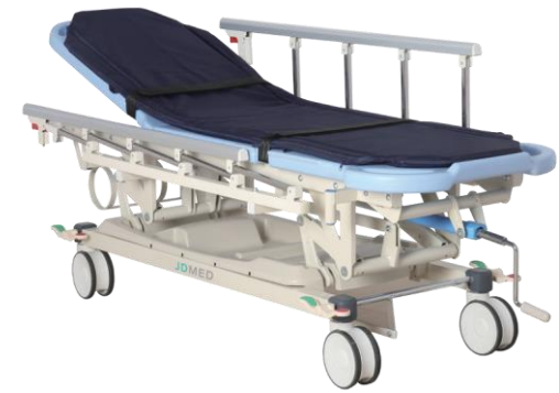
SS Emergency Stretcher