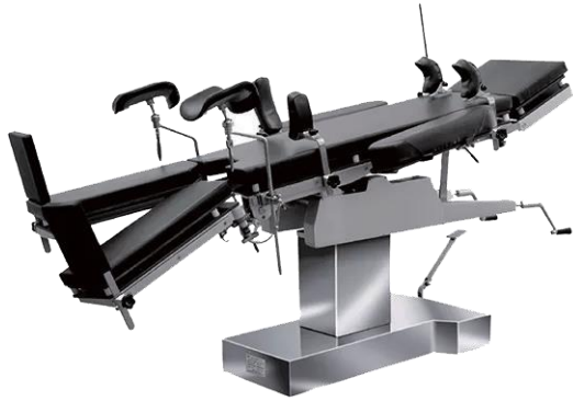
SBG Operation Table