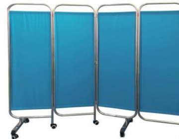
SBG Folding Screen

SBGSL016C L1930 ± 100xW910 ± 100xH95 ± 10mm