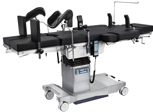
SBG Operation Table