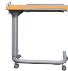
MEGA Overbed Table