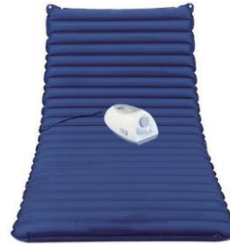
SBG Air Mattress(Single Airway Airway)

SBGSL016A L1835 ± 100xW860 ± 100xH95 ± 10mm