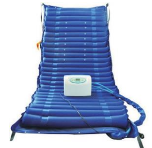
SBG Air Mattress (Three Airway)

SBGSL016B L1880 ± 100xW880 ± 100xW95 ± 10mm