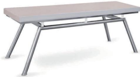
SBG Deluxe Examination Bed