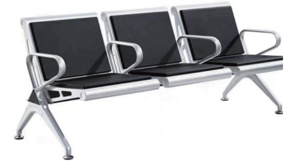
SBG Waiting Chair