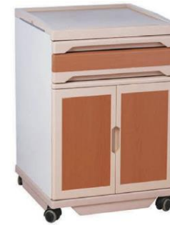
SBG and cold rolled steel)