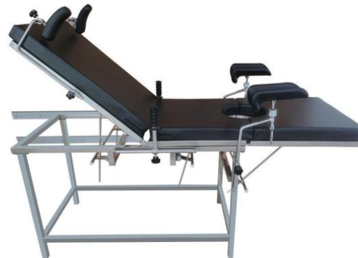
Gynecological Examination Table