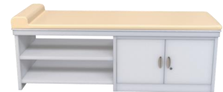
Deluxe Examination Bed