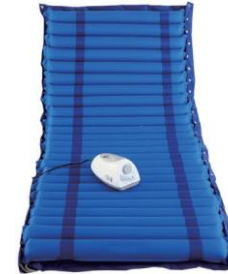
SBG Air Mattress(Double)

SBGSL016A L1835 ± 100xW860 ± 100xH95 ± 10mm