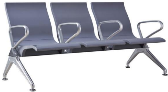
SBG Waiting Chair