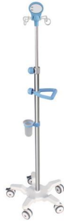
SBG I.V. Stand