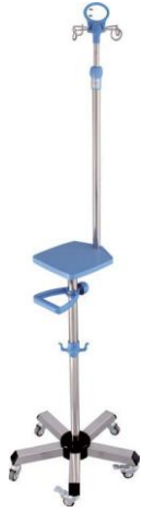
SBG I.V. Stand