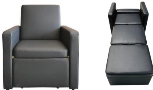
SBG Attendant Couch