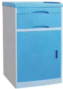
SBG Bedside Cabinet B

SBGSL121A (Multicolor) L480 × W480 × H760mm