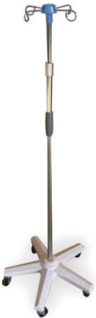
SBG I.V. Stand