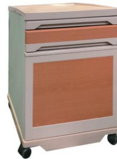
SBG Bed Side Cabinet