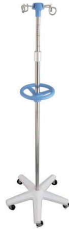
SBG I.V. Stand