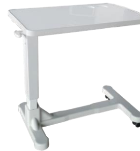
ABS Overbed Table