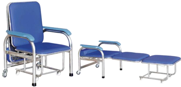
SBG Attendant Couch