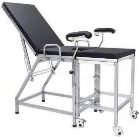
SBG Gynecological Examination Table