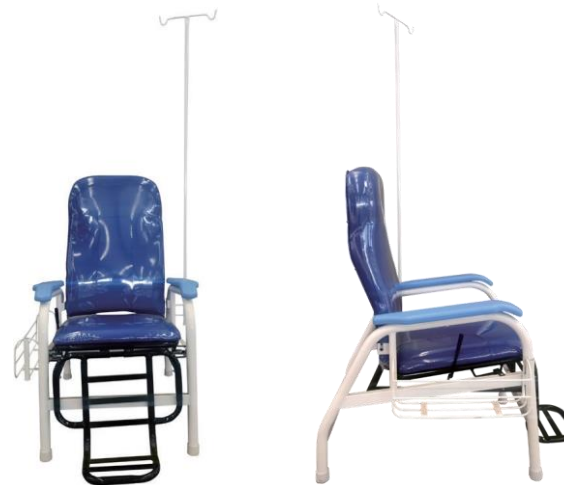
SBG InFusion Chair